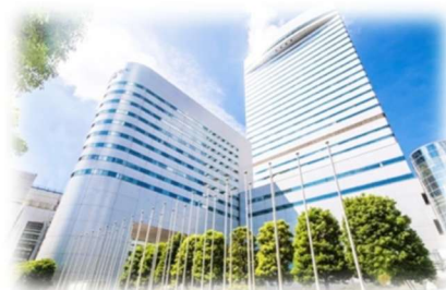
Palace Hotel Omiya / Gala Dinner