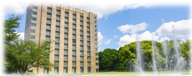
Nihon Pharmaceutical University - Saitama Campus / Conference

JR Ageo station or JR Hasuda station – (Bus) 15min – NPU Saitama Campus (Bus stop)