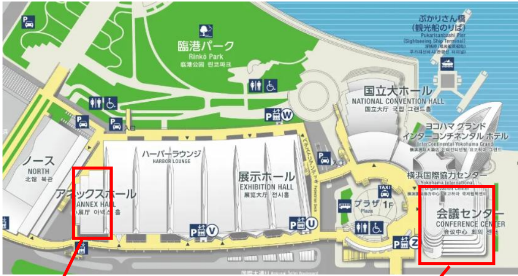
Symposium/Exhibition (ANNEX HALL 2F)